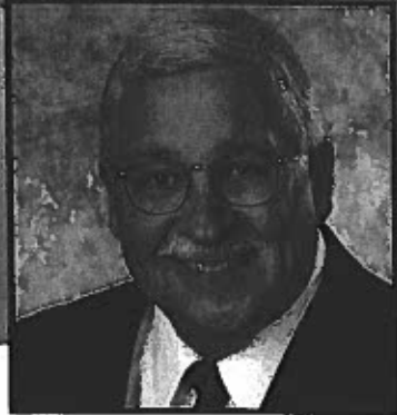
MAYOR KYLE R. HASTINGS VILLAGE OF ORLAND HILLS